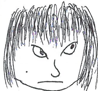
5. Fill in hair