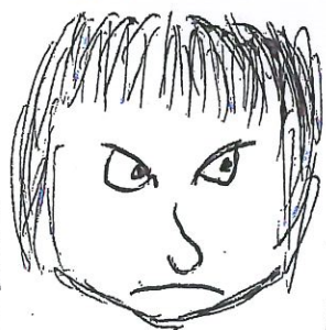
4. Mouth and Nose